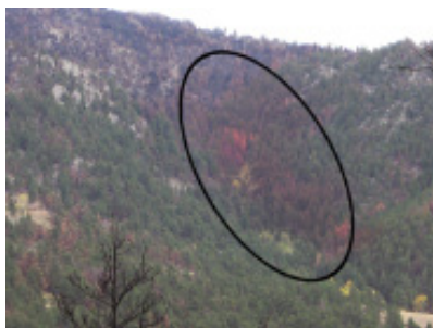
Figure 1. Fire retardant seen on trees two months after the High Park Fire in 2012.

Following a wildfire, the primary source of contamination to drinking water is from chemicals and microorganisms that can enter a fire-damaged well system. Human health could be adversely affected from either short or long term exposure to contaminants in the water and sediment may cloud water, or cause it to taste or smell smoky or earthy. Moreover, fire retardants can cause water to temporarily turn a reddish color. Fire retardants, made up of ammonium based compounds containing phosphate or sulfate, are usually red in color due to a small percentage of iron oxide (Figure 1). Generally considered harmless to humans and land animals, fire retardants do have some level of toxicity to aquatic organisms. The most toxic component of a retardant product is the corrosion inhibitor. If a fire retardant was used near a wellhead, it could possibly seep into the well over time, particularly if the wellhead was damaged, or if it is located in an area where storm water drains. In these situations, monitoring ammonia and nitrate concentrations for a period of several months is recommended.