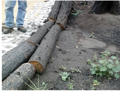
Figure 3. Sediment collected at the front of a log dam.

Replacing lost organic matter on the soil surface will help to initiate the microbial activity that is important for reducing the hydrophobicity of the soil. Spreading pine needles or large organic material near streams or ponds to intercept runoff is also a common practice.