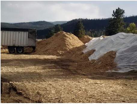
Figure 2. Mulch ready to be installed as a hill slope treatment shortly after the High Park Fire in 2012.

called hydrophobicity. This hydrophobic condition increases the rate of water runoff and can overwhelm water bodies in the event of thunderstorms. Commercially available straw wattles and silt fences can be purchased and installed in areas where runoff is more dispersed over a broad flat area.